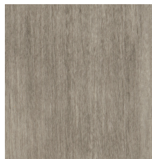
HEATHER-V3 00174 V3 - MODERATE VARIATION