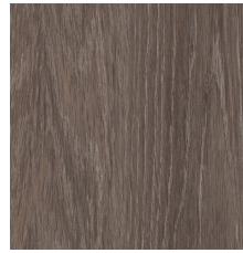
FRONTIER-V2 00774 V2 - SLIGHT VARIATION