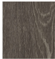
HEDGEROW-V2 00564 V2 - SLIGHT VARIATION