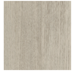
YARROW-V2 05013 V2 - SLIGHT VARIATION