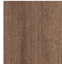
COURTYARD-V3 07005 V3 - MODERATE VARIATION