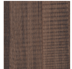
TRELLIS-V3 07007 V3 - MODERATE VARIATION