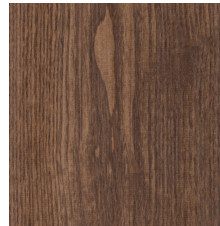
PERGOLA-V3 07003 V3 - MODERATE VARIATION