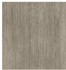
HEATHER-V3 00174 V3 - MODERATE VARIATION