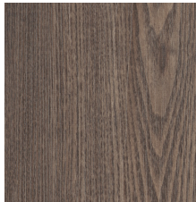
LATTICE-V2 07008 V2 - SLIGHT VARIATION