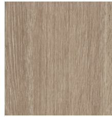
BOXWOOD-V2 00775 V2 - SLIGHT VARIATION