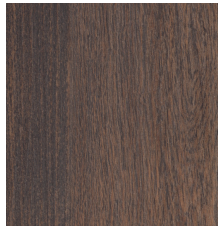
PAVILLION-V4 05019 V4 - SUBSTANTIAL VARIATION