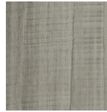
SHADY GROVE-V3 05012 V3 - MODERATE VARIATION