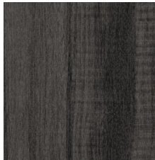
INKBERRY-V3 05016 V3 - MODERATE VARIATION