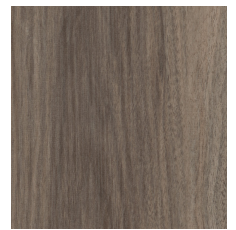
MOORELAND-V4 00568 V4 - SUBSTANTIAL VARIATION