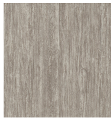
JUNIPER-V2 00559 V2 - SLIGHT VARIATION