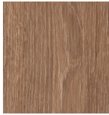
LAUREL-V2 00684 V2 - SLIGHT VARIATION