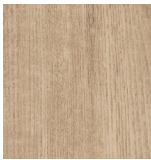
SPROUT-V2 00173 V2 - SLIGHT VARIATION