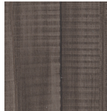
TOPIARY-V3 07004 V3 - MODERATE VARIATION