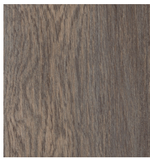
ASTER-V4 00170 V4 - SUBSTANTIAL VARIATION