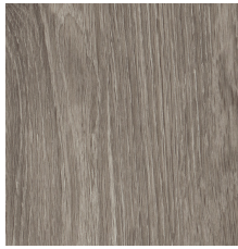
HEMLOCK-V2 00572 V2 - SLIGHT VARIATION