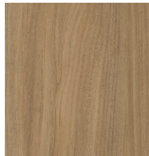
HONEY-V2 00163 V2 - SLIGHT VARIATION