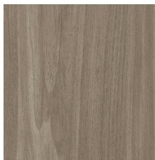
ELEMENT-V2 00549 V2 - SLIGHT VARIATION