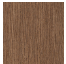
CHESTNUT-V2 00837 V2 - SLIGHT VARIATION