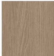
GINGER-V2 00146 V2 - SLIGHT VARIATION