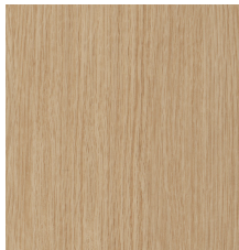
BARE-V2 00132 V2 - SLIGHT VARIATION