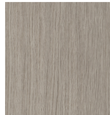
MOONLIGHT-V2 00527 V2 - SLIGHT VARIATION