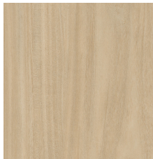
CREAM-V2 00127 V2 - SLIGHT VARIATION