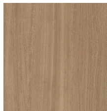
CAMEL-V2 00713 V2 - SLIGHT VARIATION