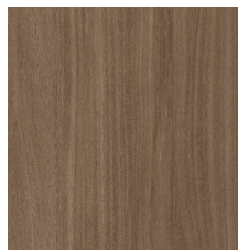
CAIRN-V2 00764 V2 - SLIGHT VARIATION