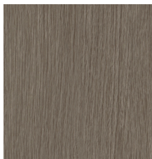
NICKEL-V2 00574 V2 - SLIGHT VARIATION