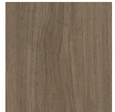
RUNE-V2 00531 V2 - SLIGHT VARIATION