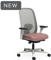
Civara Task Chair >

Civara task chairs and stools infuse any workspace with refined sophistication, seamlessly blending aesthetics, well-being, and ergonomic performance. Offered in a range of mesh or upholstery options and three frame finishes, Civara delivers exceptional support for long work sessions, proving that high performance and high design can coexist beautifully.