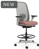
Civara Task Stool >