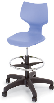
Model # Shown: 11842