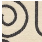
003 Black On White