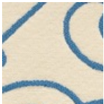
002 Ultramarine On White