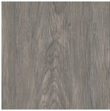
Beacon Hill Oak 00604