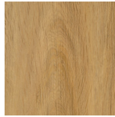
Fenway Oak 00615