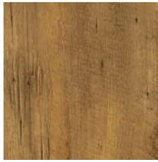
Fort Hill Oak 00609