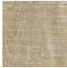
Newbury Oak 00611