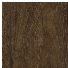
Morchella 06007 LRV 9.5 | L* 36.84 V2 - Slight Variation