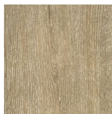
Ivory 06005 LRV 25.4 | L* 57.48 V2 - Slight Variation