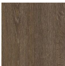
Tannery Brown 06002 LRV 10.3 | L* 38.4 V2 - Slight Variation