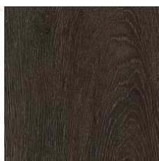
Summer Truffle 06003 LRV 9.2 | L* 36.34 V2 - Slight Variation