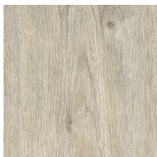
Cremini 06008 LRV 35.6 | L* 66.23 V3 - Moderate Variation