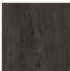
Abyss 06004 LRV 6.6 | L* 30.97 V3 - Moderate Variation