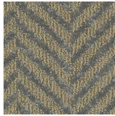
Mirrored 03525 LRV 12 | L* 41.2