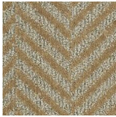
Gilded 03250 LRV 16.1 | L* 47.11