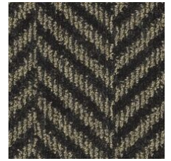
Truffle 03700 LRV 5.3 | L* 27.54