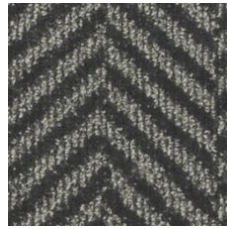
Pewter 03500 LRV 6.9 | L* 31.68