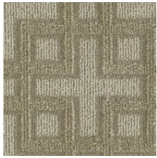
Camel Hair 03120