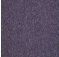
Plum Martini 71965