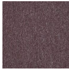
Rose Trellis 71830