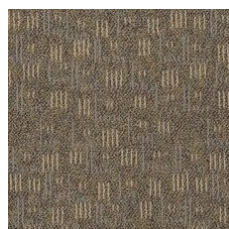
Bare Necessitie 40150