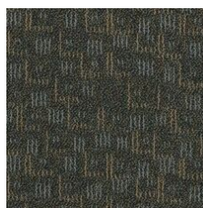
Steeling Beauty 40500