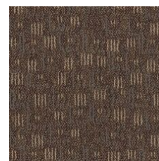
Ciao Bella 40855