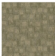
Exotic Seasalt 40315