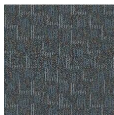
Harbouring Desi 40485