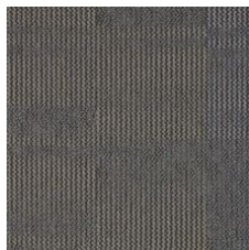
Silver Lining 58530