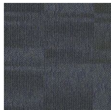
Be Jeweled 58485