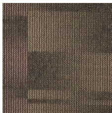
Color My World 58500