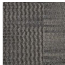
Sheer Magnetic 58585