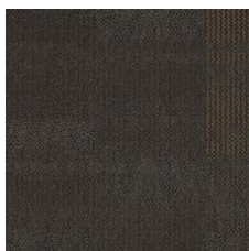
Copper Frost 58760