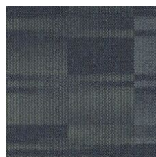
Make A Splash 58460