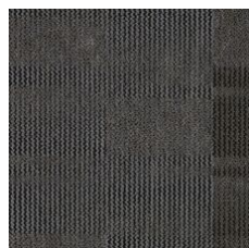
Metal Guru 58595