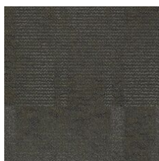
Urban Jungle 58335