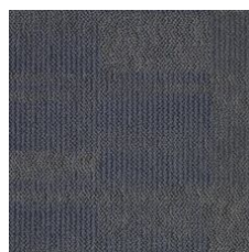
Absolute Blu 58402