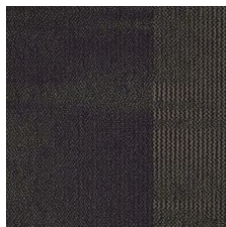
Black To Busine 58505