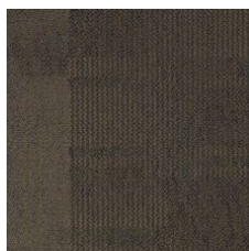
Chocolate Cravi 58761