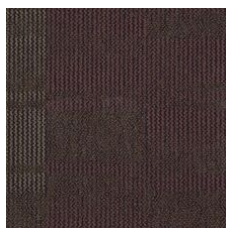
Haute Stuff 58850