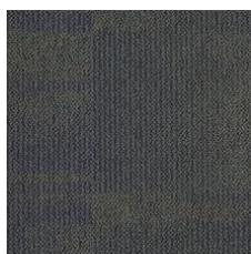
Fused Glass 58315