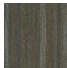
Cast Bronze 92601