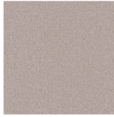
Comfort 73755 Weldrod 05228