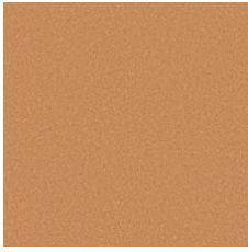
Energy 73675 Weldrod 05219