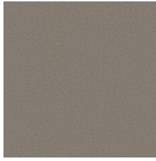
Thrive 73700 Weldrod 05243