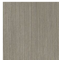
French Grey 02500 V3 - Moderate Variation