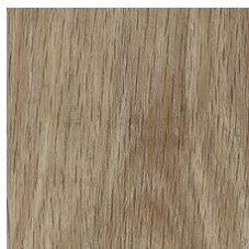
Provence 02140 V2 - Slight Variation