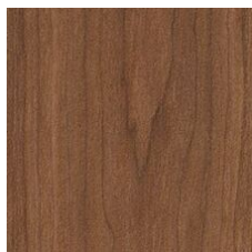
Cikel Cherry 02571 V2 - Slight Variation