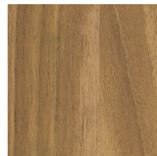
Teak Green 02544 V2 - Slight Variation