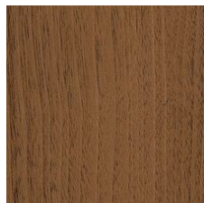
Teak Light 02530 V3 - Moderate Variation