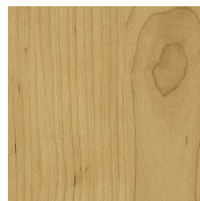
Gallery Maple 02200 V2 - Slight Variation