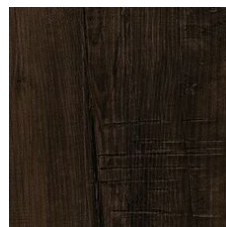
Whiskey Barrel 02580 V2 - Slight Variation