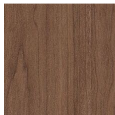
Chocolate Chry 02573 V2 - Slight Variation