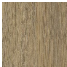
Driftwood 02150 V2 - Slight Variation