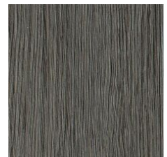
Skyline 02560 V2 - Slight Variation