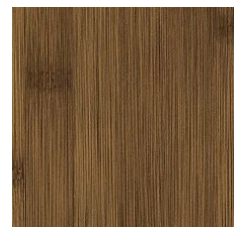
Bamboo Natural 02701 V2 - Slight Variation