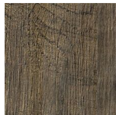
Telluride 02540 V4 - Substantial Variation