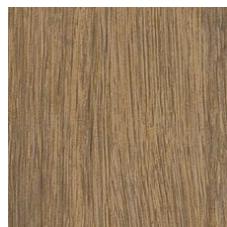
Sand Dune 02160 V2 - Slight Variation