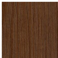
Asian Mahogany 02572 V2 - Slight Variation