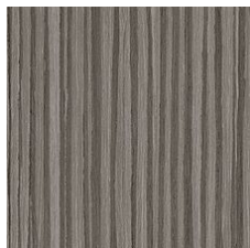
Zen 02520 V1 - Uniform Appearance