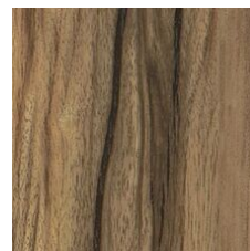
Olivewood 02700 V3 - Moderate Variation