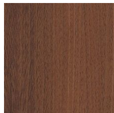
Brazilian Chry 02534 V3 - Moderate Variation