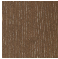
Restoration Oak 00986