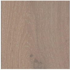
Exemplar Oak 01075