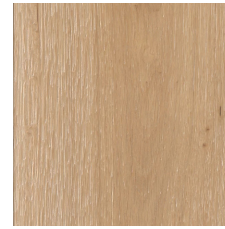
Reminisce Oak 01010