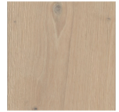
Rejuvenate Oak 01070