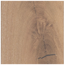
Invigorate Oak 00146