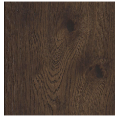
Motif Oak 00533