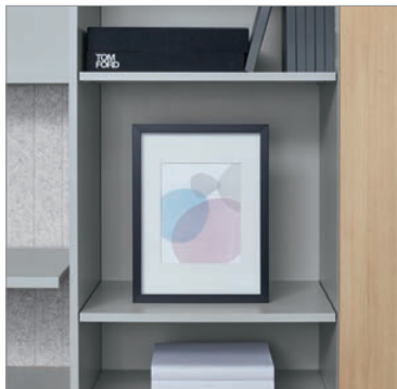
Height adjustable shelves