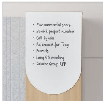
Magnetic whiteboard (optional)