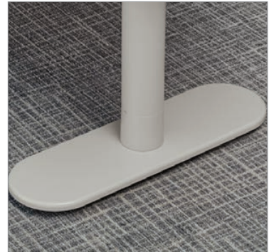
Fixed or height adjustable legs support worksurfaces and returns