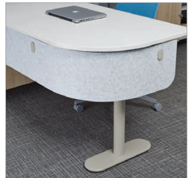
PET Felt modesty panel