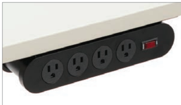
Below surface power bars (double-sided bar shown)