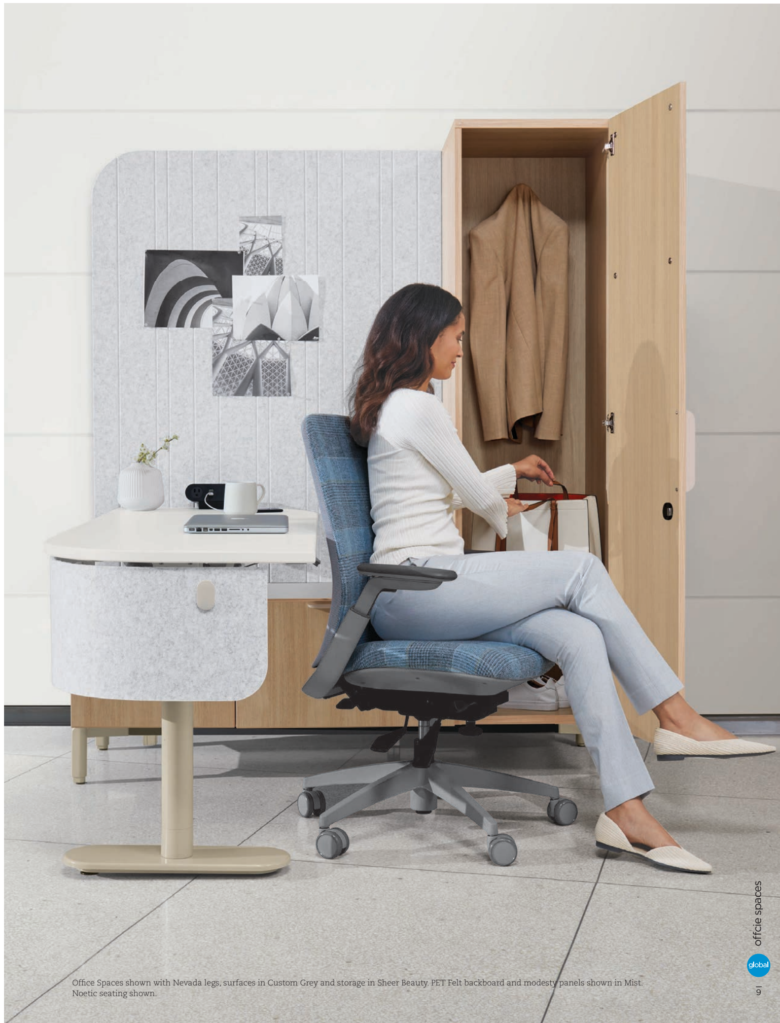
Office Spaces shown with Nevada legs, surfaces in Custom Grey and storage in Sheer Beauty. PET Felt backboard and modesty panels shown in Mist. Noetic seating shown.