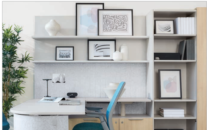
Backboards with shelves