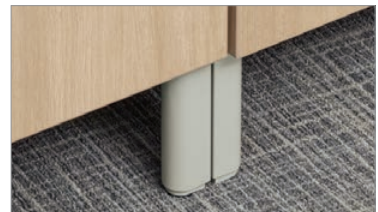
Storage leg with leveler