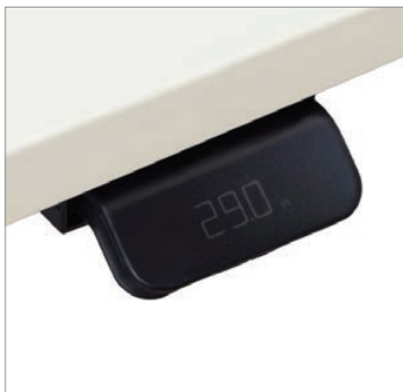
Control unit on height adjustable surface