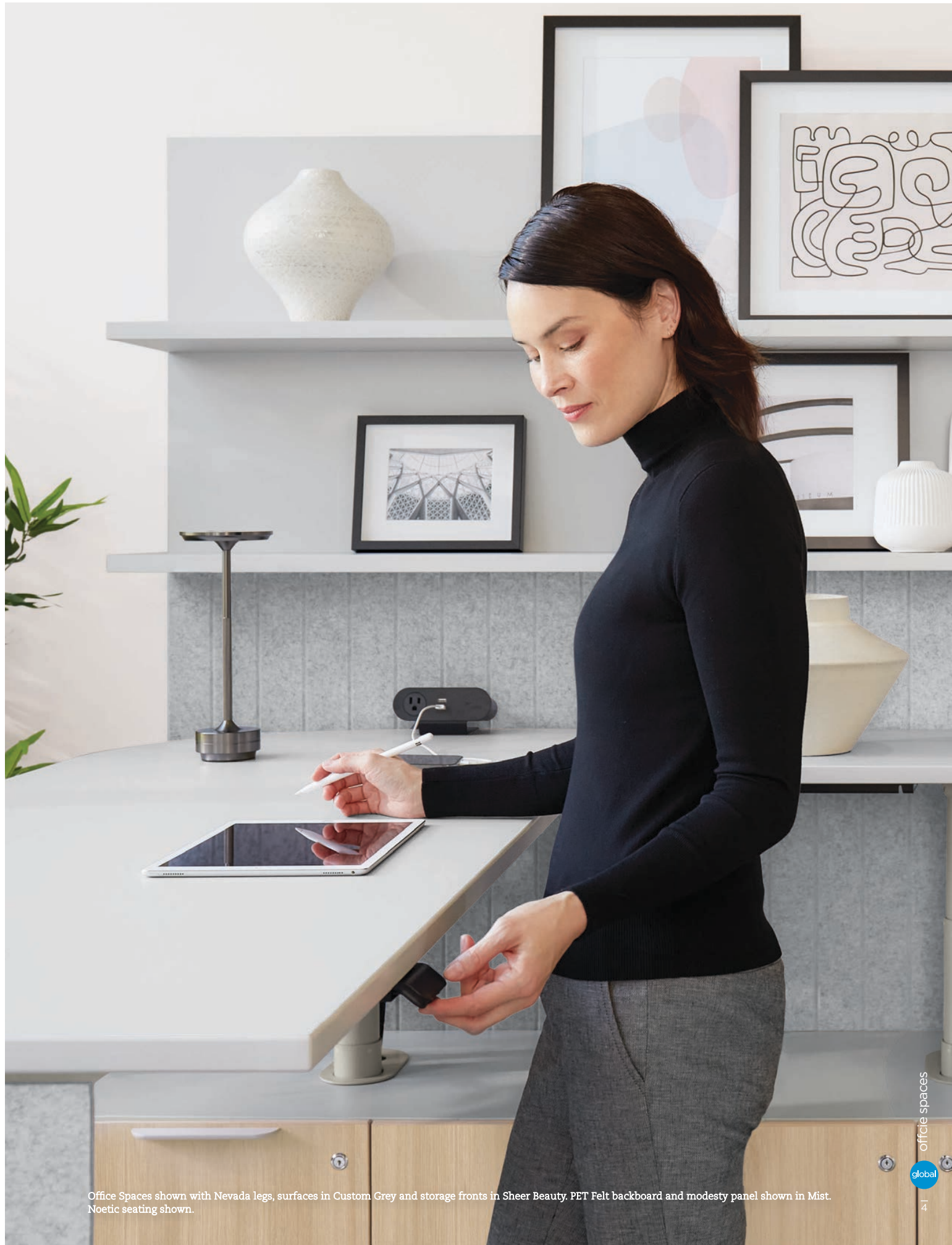
Office Spaces shown with Nevada legs, surfaces in Custom Grey and storage fronts in Sheer Beauty. PET Felt backboard and modesty panel shown in Mist. Noetic seating shown.