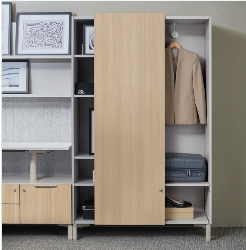
High storage with sliding door