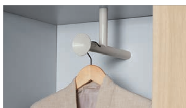
High storage coat hook/coat rail