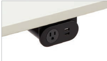
Below surface power modules (1 AC, 2 USB-A shown)