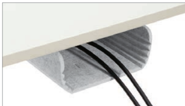
PET Felt wire manager