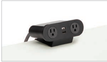
Edge/clamp mount power modules (2 AC, 2 USB-A shown)