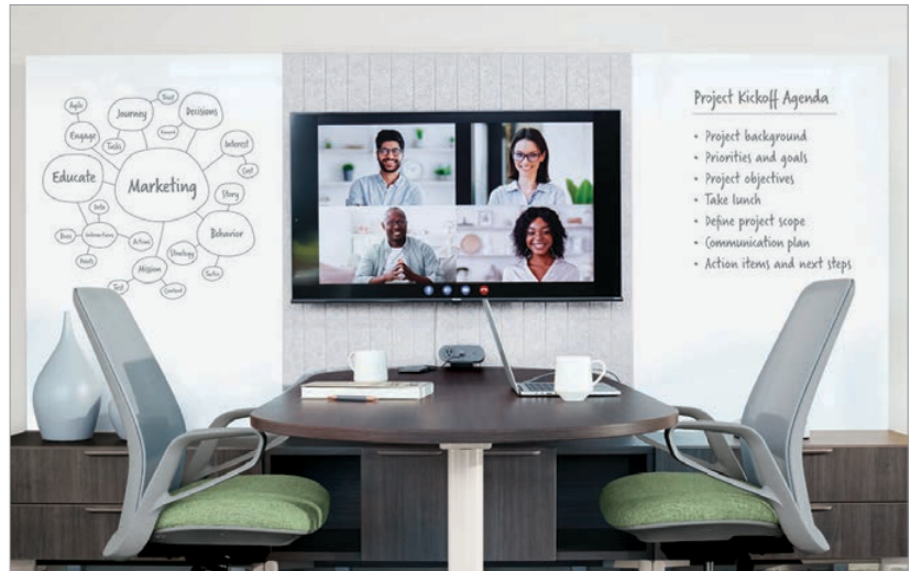
Backboards available with tackable PET Felt, laminate or whiteboard surfaces and support media displays