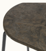
Coffee Waste Dark