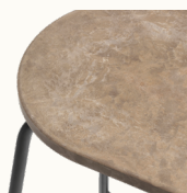
Coffee Waste Light

The Earth Stool Backrest is made with a frame of 20% recycled steel and a seat in Matek® and designed by architect Eva Harlou. Innovative technology allows us to recycle fibre-based waste materials with recycled plastic waste in the Matek® material. The Earth Stool comes with a seat in two variants of Matek®, either Coffee Waste Dark or the lighter version Coffee Waste Light. With its slim design and light weight, the stool is equally suitable for private and public use.