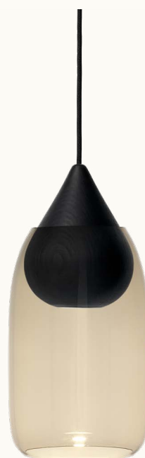
Black / Smoked