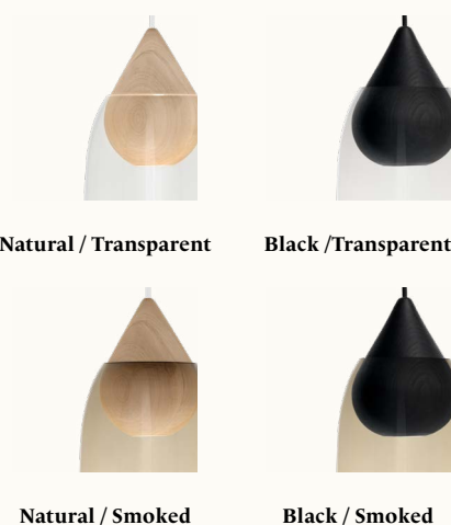
Natural / Transparent

Crafted from solid pine wood, Liuku Pendant leaves its focus on the simple silhouette. The Liuku Pendant collection consists of two base shapes, 'Ball' and 'Drop', with an additional hand-blown glass shade. The minimalistic design makes the Liuku Base ideal both hanging as a single pendant, aligned or in decorative clusters for both residential and commercial decor.