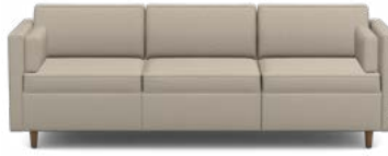
THREE SEAT Height: 29¾" Width: 87¼" Depth: 30½"