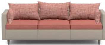
THREE SEAT Height: 31½" Width: 87¼" Depth: 30½"