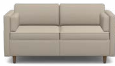
TWO SEAT Height: 29¾" Width: 60½" Depth: 30½"