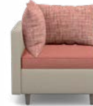
TRUE CORNER Height: 31½" Width: 30½" Depth: 30½"