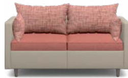
TWO SEAT Height: 31½" Width: 60½" Depth: 30½"