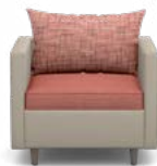
SINGLE SEAT Height: 31½" Width: 33¼" Depth: 30½"