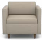
SINGLE SEAT Height: 29¾" Width: 33¼" Depth: 30½"