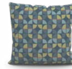
SQUARE Height: 18" Width: 18"