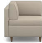
TRUE CORNER Height: 30½" Width: 29¾" Depth: 30½"