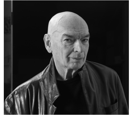
——— Pritzker Prize-winning architect Jean Nouvel creates buildings and furnishings that are intimately in harmony with their surroundings — modern expressions of nature and culture.

The elementary quality I seek has nothing to do with minimalism or brutalism: it involves ambiguity and complexity. The simpler an object looks, the more obvious or familiar, the harder it is to make, the more emotion it offers, and the better it stands the test of time.”