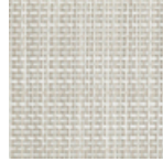
010 Mandvi Beach