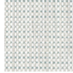
014 Himalayan View