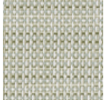
003 Badal Cloud

Complete product information at knolltextiles.com 800.645.3943