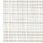
013 Bijali White