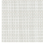
009 Moti Pearl