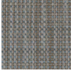
016 Chandi Haze