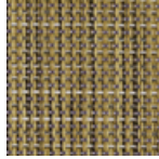
008 Meti Mud