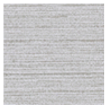
003 Wax Transfer