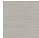
020 Plaster Board