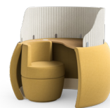
18" H Privacy Panel