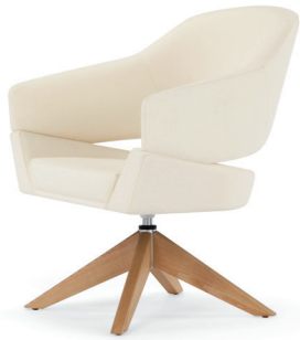
Fully upholstered, wood swivel base.