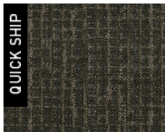
3564 Authentic ...