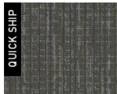
3566 Central A...