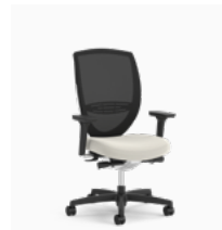
Task Chair, Low Height Base