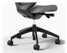
Plastic Base (shown) or Aluminum