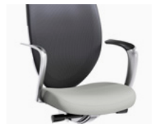
Conference Arm with Arm Cap