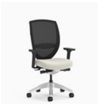
Task Chair, Mesh Back