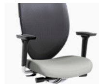
2D or 4D Height Adjustable Arm