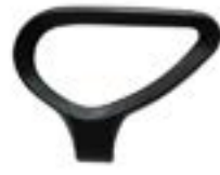
Fixed Loop Arm (KR48)