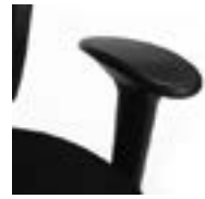
Adjustable T-Arm (JR39)