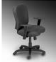
Task Chair (KI62/JR39)