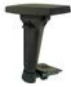
4D T-Arm (JR69)