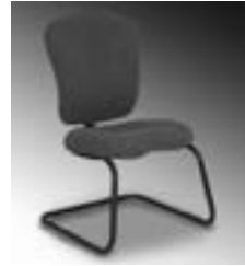
Sled Base Chair (KI60S)