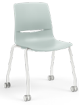
4-Leg with Casters