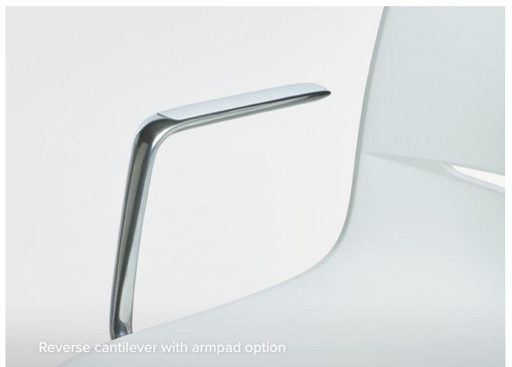
Reverse cantilever with armpad option