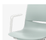
Reverse Cantilever with Armpad