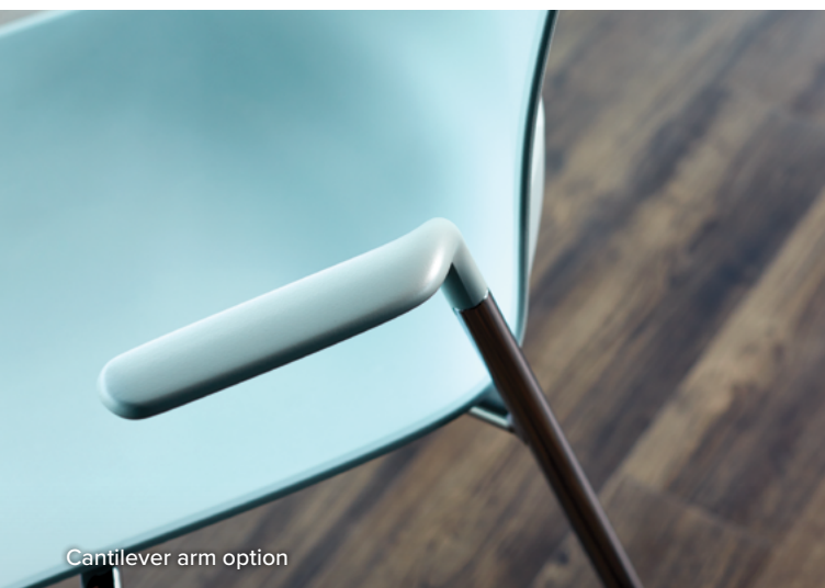
Cantilever arm option