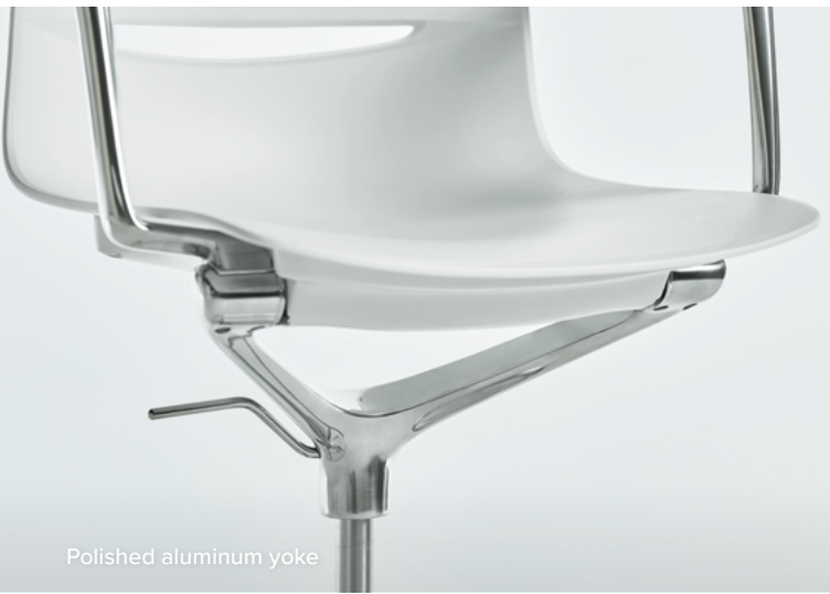
Polished aluminum yoke