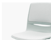
Seat & Back