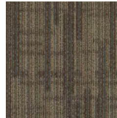
00765 rock scissors paper