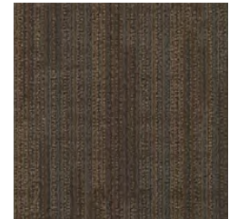
00798 burlap bag