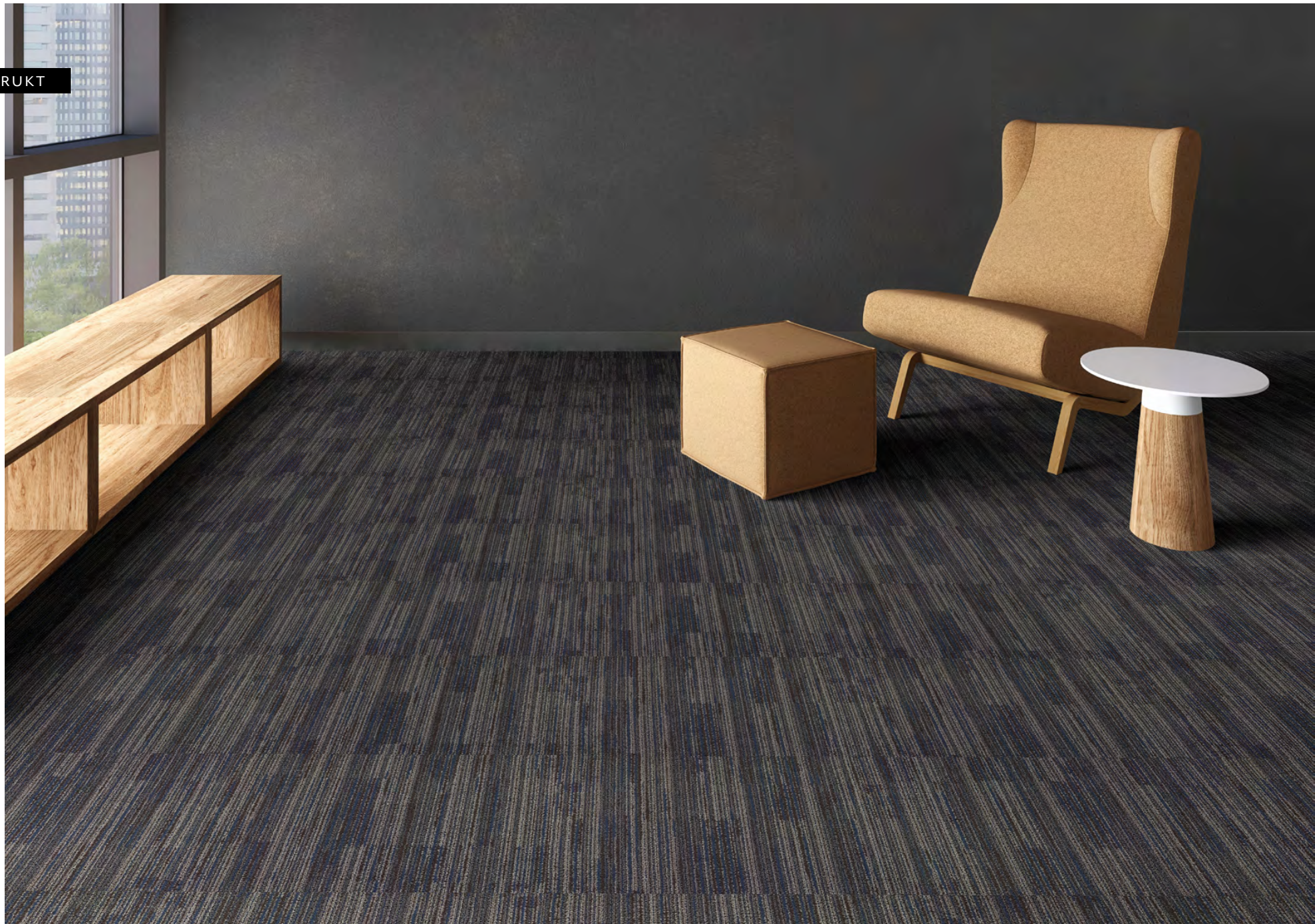
INTRINSIC in blueprint / installed monolithic