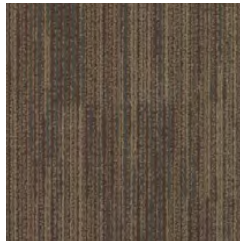
00711 tea cakes & chocolates, oh my