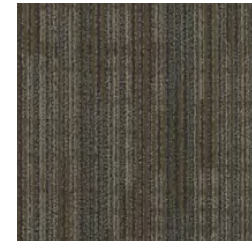
00522 mood du jour