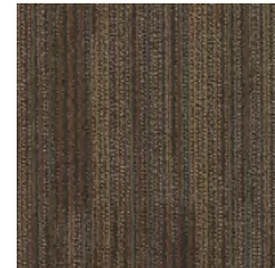
00798 burlap bag