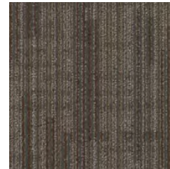
00758 industrial edge