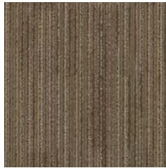
00173 beach haus