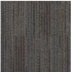
00526 chrome sweet chrome