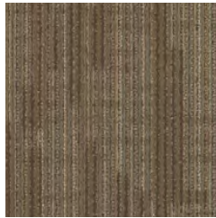
00173 beach haus