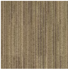
00107 concrete mix