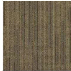
00327 laundered sheets