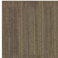
00757 daily bread