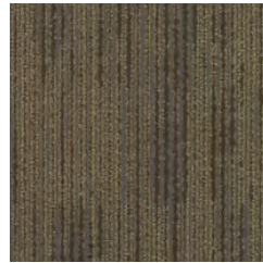
00327 laundered sheets