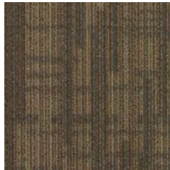
00711 tea cakes & chocolates, oh my