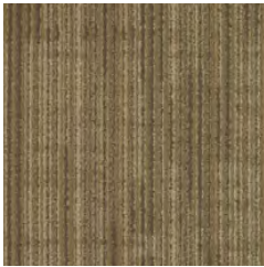
00107 concrete mix