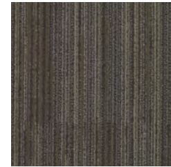
00522 mood du jour