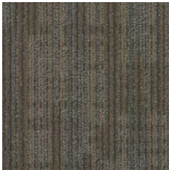
00526 chrome sweet chrome