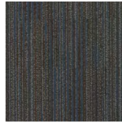
00445 blue sky thinking