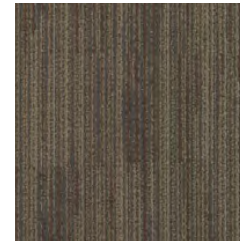
00765 rock scissors paper