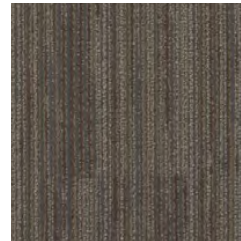
00758 industrial edge