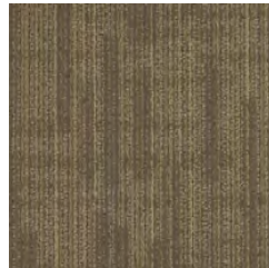
00757 daily bread