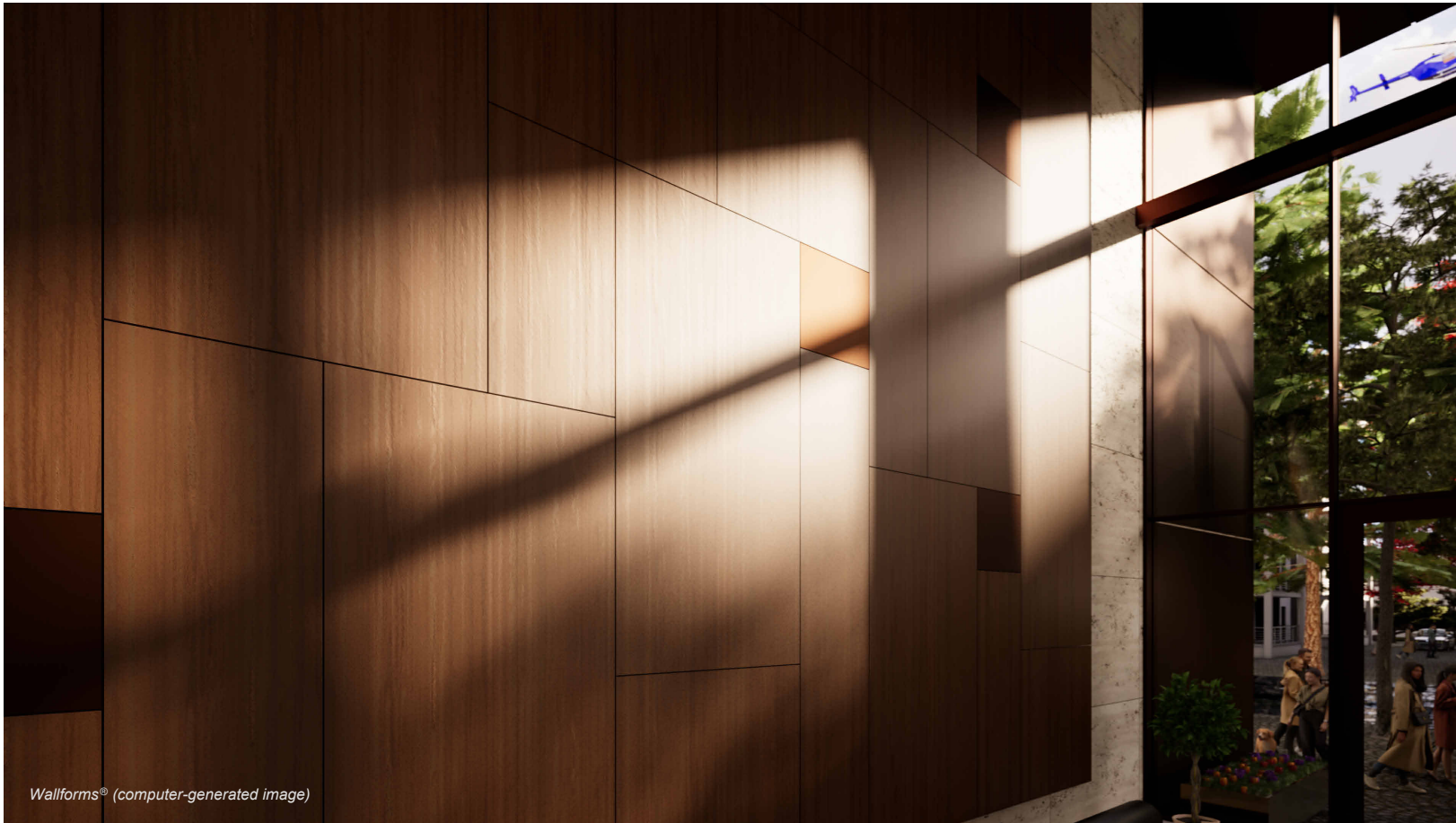
Wallforms® (computer-generated image)