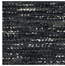
Vibrant Mole 81500