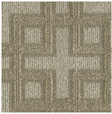
Camel Hair 03120