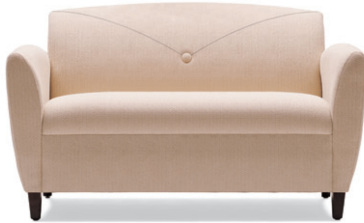
670-2 Val Loveseat