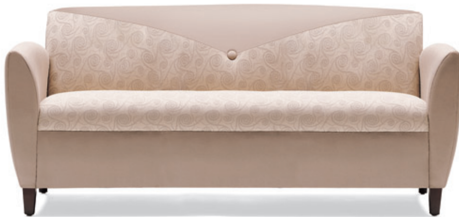
670-3 Val Sofa