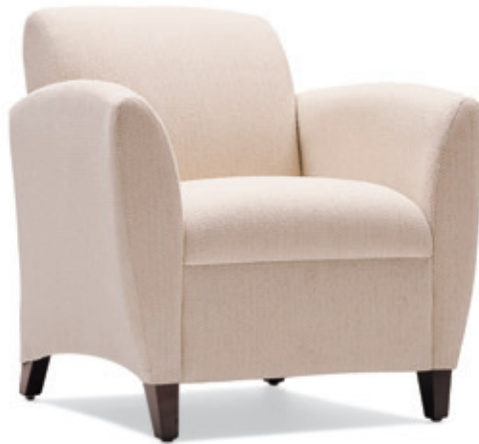
Shown optionally without v-stitch and button