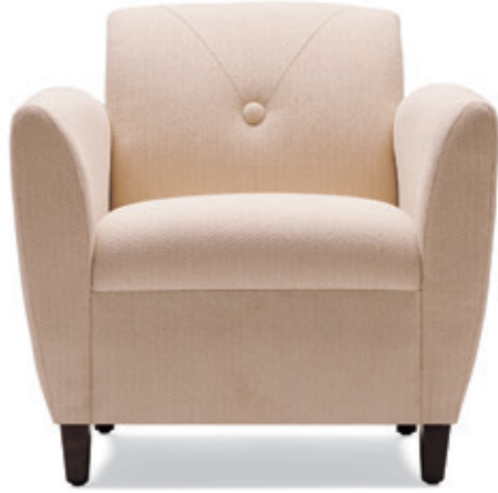
670-1 Val Lounge Chair