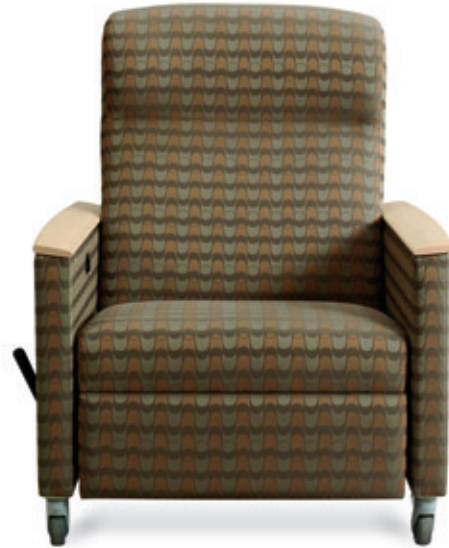
1614 Bariatric Recliner Shown with optional wood arm caps

A transitional design makes the Carolina Bariatric Recliner a stylish and functional choice for Bariatric patient areas. Rated for 750 pounds the Bariatric Recliner's foot rest and back operate independently of each other and are easy for both caregiver and patient to operate. The back can be infinitely positioned and reclines fully to a comfortable sleep position. A number of options including wood and polyurethane arm caps are available and create a perfect option for Bariatric treatment areas.