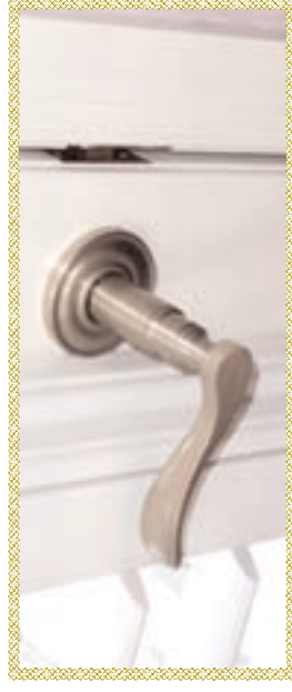
Standard Hardware: A lock consisting of a latch and a deadbolt only.

Usually, the manufacturer puts a stamping on some part of the hardware. It is typically on the handle, backplate or plate on the door latch edge. To decipher the stamped logos to their correct manufacturer match them to the logos on the compatibility chart below. If you can't find the stamping but know the door manufacturer look on the compatibility table for the door manufacturer and cross-reference it to the handle manufacturer.