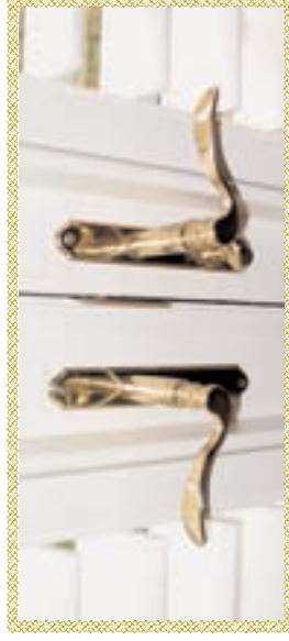
©2005 RAK LTD. "X-10-DOR", "RAK LTD" and RAK LTD logo are trademarks of RAK LTD. All other logos are trademarks of represented companies.

With that idea they created their first (X-10-DOR™) door handle extension design and started RAK LTD in 2000.