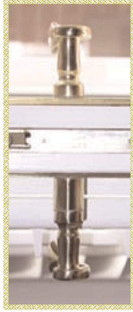
Multipoint Hardware: Hardware that has multiple locking points which simultaneously lock into place when you lift the handle.

*Custom sizes & finishes available, call for quote and availability.