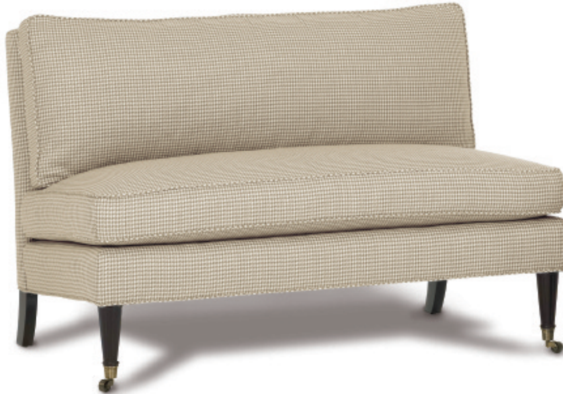
S852-ST (shown) La Salle Semi-Attached Back Settee S852D-ST La Salle Semi-Attached Back Settee Skirted